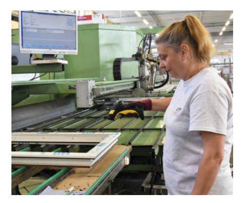
At TMP, there are almost no production workstations that are not incorporated into the networked production with A+W Cantor CIM

chine technologies controlled by state-of-theart industry software. Paper at TMP? That's so yesterday. Today, A+W Cantor CIM monitors and barcode scanners reliably provide the right information at the right time, they enable real-time status messages and they help automatically initiate production processes. The barcode label includes all information required for the quick and reliable handling of all production processes.