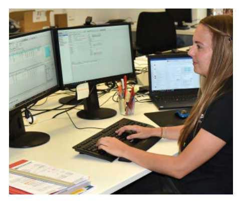
Order entry with A+W Cantor