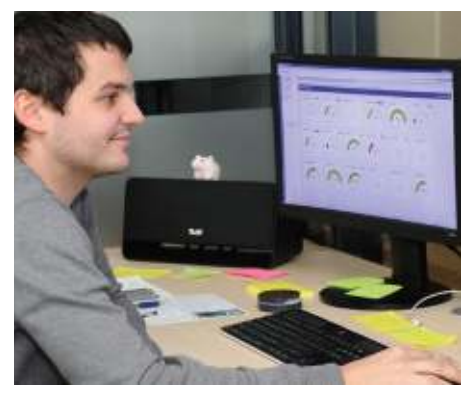
With A+W Cantor Production, the production manager in exterior blind production always has an overview of his orders at every workstation up to shipping.

Romana Eibl, Inside Sales, "The processes have been speeded up a great deal with the A+W Cantor software; the exchange between departments works much faster and more reliably. Thanks to ongoing status updates, we always have a reliable overview of the state of production of each order and each individual product."