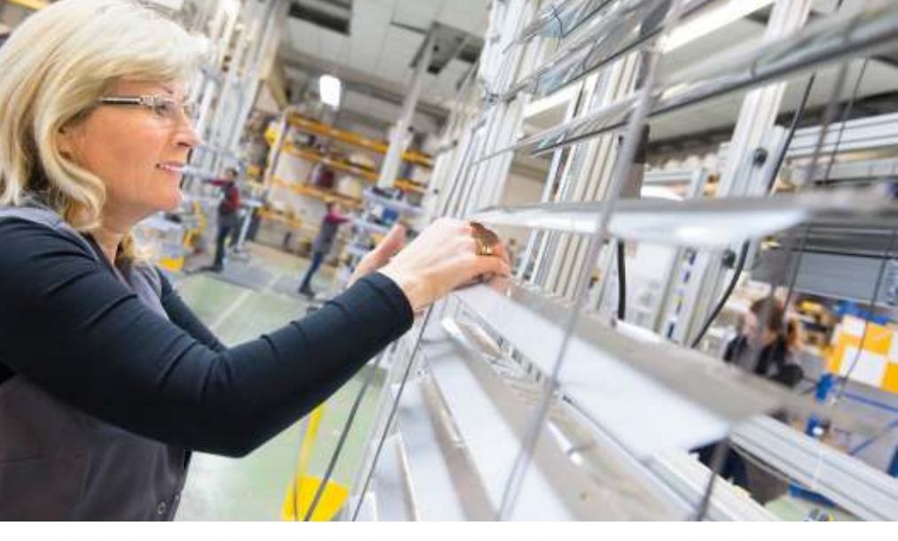
Venetian blind production at Schlotterer. Thanks to the RETROLux slats, the heat stays outside, while valuable sunlight is directed into the interior of the room.