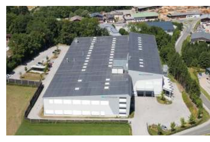
Space for highly-automated production: with the new facility started up in 2012, Schlotterer expanded its production capacities, especially its exterior blind production.