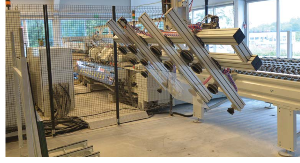
On the path to Industry 4.0: robot loading the double-sided automatic edging machine.