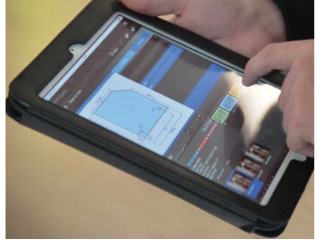
From the Webshop directly into production: the Rakvåg team is enthusiastic about A+W iQuote and was among the first users of the program.