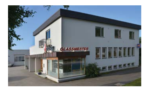
In addition to the main plant with over 6,000 m<sup>2</sup> production area, Rakvåg has a second branch in Molde with a glazery, sales of glazier demand and an attractive exhibition.

From technical order processing, a CAD file is sent to the CNC machine; in addition to the usual geometric data for grinding, hole drillings, cutouts, etc., this file also contains all machine parameters, for example for selection of the tools, alignment of the sheet, and suction positioning. The CAM-DXF file is transmitted to the CNC center, where all machine processes are now handled completely automatically. Roy rejoices: "This means that there is no need for time-consuming manual machine programming." This method corresponds to the requirements for a smart factory in the world of Industry 4.0.