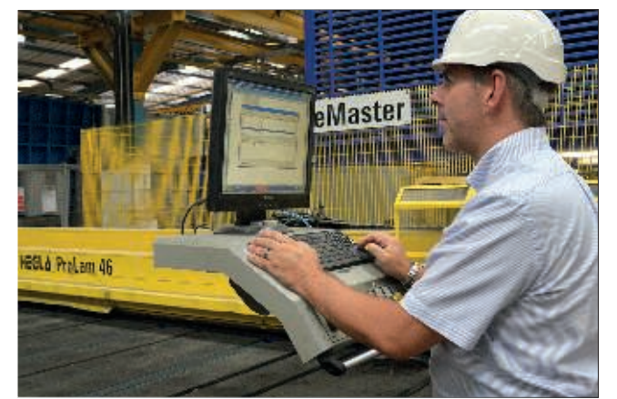
On the HEGLA combi cutting line, it is possible to cut laminated in flexible alternation with float. The remaining sheets are kept in an HEGLA Remaster storage system and incorporated into ongoing production according to the situation by the A+W optimisation.