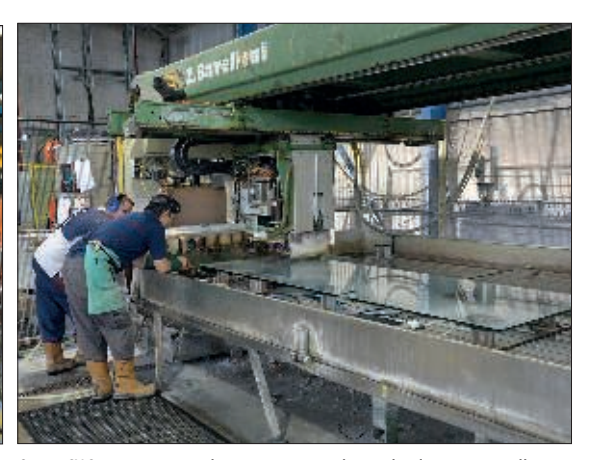
On its CNC processing machines incorporated completely automatically into the A+W network, FGI manufactures glass for interior applications such as separator walls, tabletops, shower doors, glass door systems, etc.

question "where is my pane?" at any time.