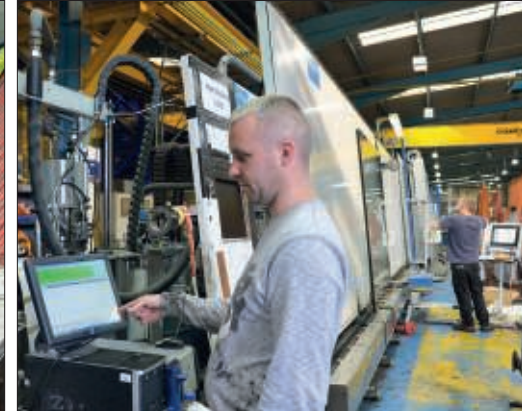
A+W Production Monitor at the discharge from the Bystronic IGline: each pane produced is registered; in case of breakage or poor units, re-working is initiated.